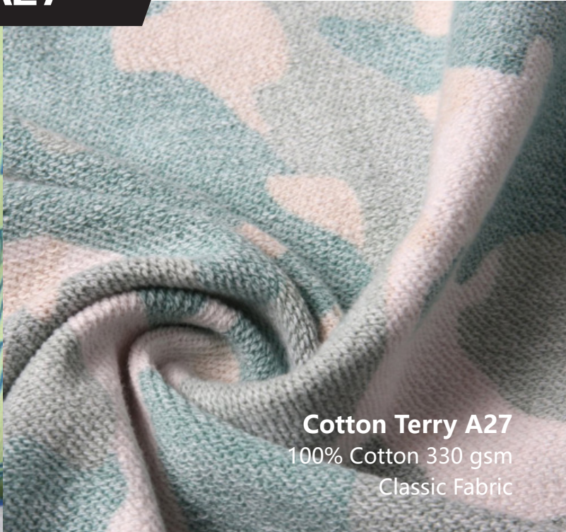
Cotton Terry A27 100% Cotton 330 gsm Classic Fabric